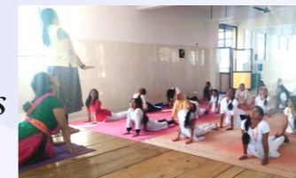
Yoga the way to a healthy life at CICMS