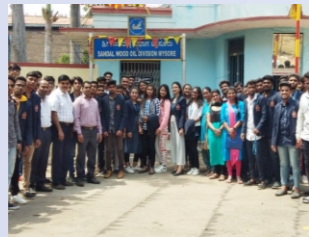
At Mysore Sandal Oil Factory