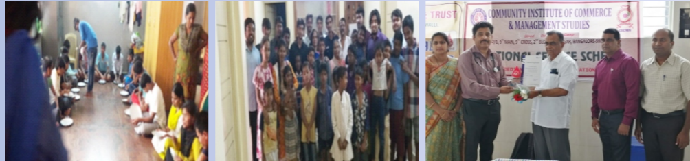
Students at the Blind School & Orphanage