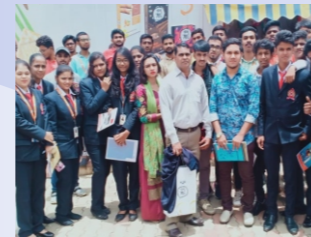
Learning Experience at Garuda Polylflex