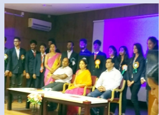
Language Club Inauguration