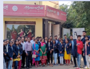
A Day at Mysore Silk Factory