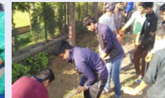
Students engaged in cleaning the roads in and around Jayanagar