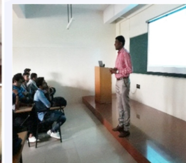
Students Attending Sessions on Campus Industry Interface