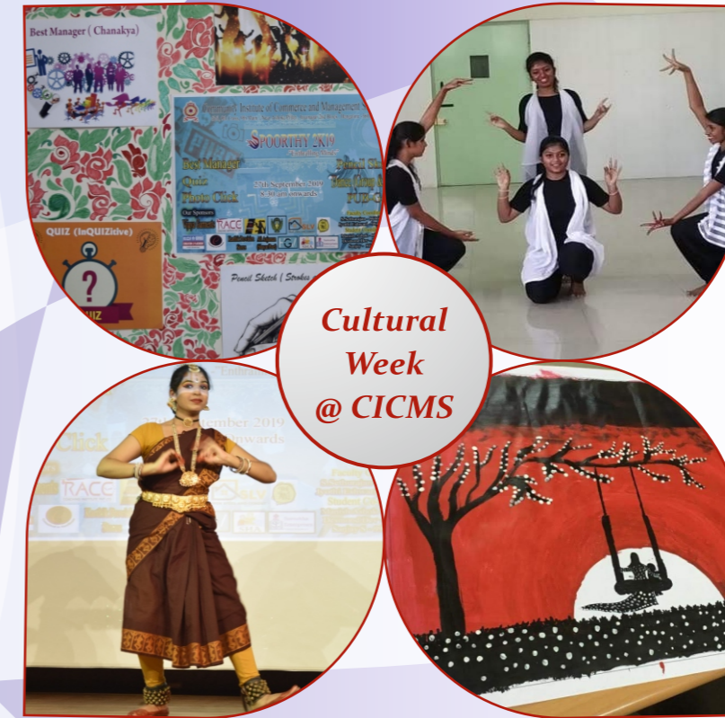
Cultural Week @ CICMS