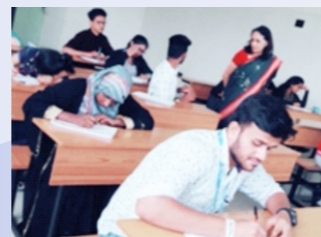
Anagram & Spellathon

The Way Forward to Creativity and Talent Acquisition